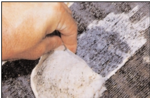
When this coil was removed from service, an interior packed with dirt and grime was revealed, despite hours of cleaning effort.

To illustrate this, let's imagine a coil designed for 4,000 CFM at .4-in. WG pressure drop. Your test measurements indicate only 3,000 CFM (25% low) at .5-in. WG (25% high). Neither of these results looks too serious, but using the fan law formula: